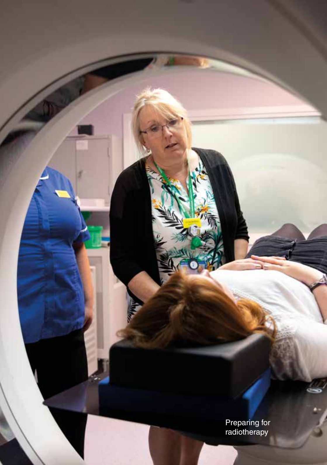
Preparing for radiotherapy